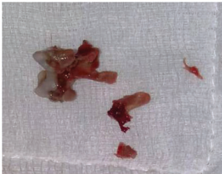
Figure 2. Laryngotracheal foreign body (chicken neck bone).

occupying the laryngotracheal region without any symptoms is an even rarer occurrence. 15