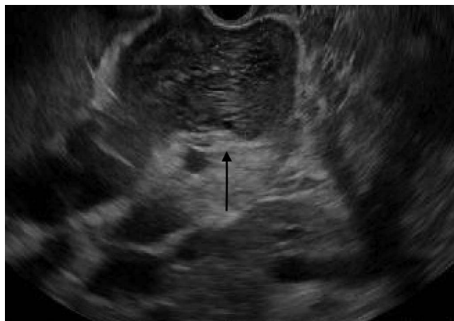
Figure 1. Endoscopic ultrasound image of a dilated common bile duct with mucin (arrow points to the dilated CBD with echogenic material representing intraductal mucin).

IPNB is a rare tumor characterized by intraductal papillary growth that can develop anywhere along the biliary tree. Mucin hypersecretion and biliary dilation can be seen. Clinically, IPNB can present in several ways including asymptomatic biliary dilation seen incidentally on cross-sectional imaging, elevated