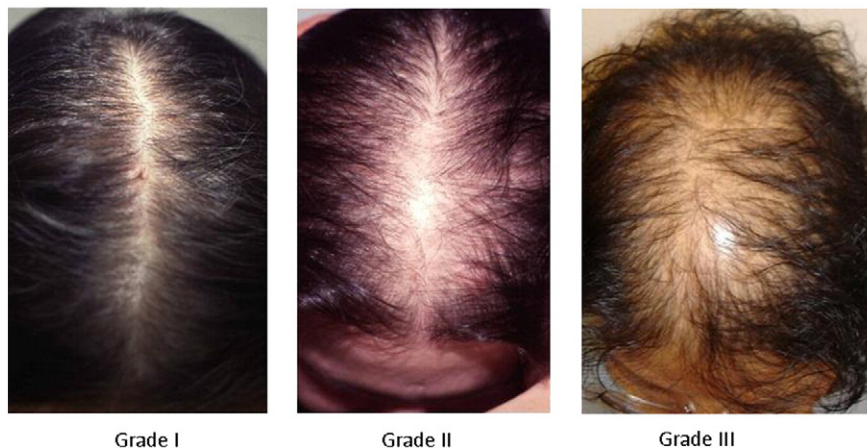
Figure 2. Androgenetic Alopecia in Women. Ludwig Classification.

Weathering is defined as the cumulative effect of environmental factors on the physicochemical structure of the hair. Hair damage induced by environmental factors including UV, humidity, wind and chemicals in hair products and procedures, has a negative impact on the growth and texture of the hair fiber. Grooming habits and weathering interplay in the process of hair wearing and both can compound the natural decrease in hair density related to age-related thinning/PHL. Typically in Caucasians and Asians, when the inciting factor is weathering, the