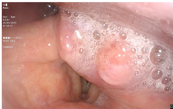
Figure 3 Case 6: fiber-optic examination before surgery.

I have already described successful use of the C-MAC videolaryngoscope in morbidly obese patients who could be difficult to intubate. 2 Aziz et al described the use of the C-MAC videolaryngoscope in patients with a predicted difficult intubation, but the patient selection for this study included patients with a reduced cervical mobility either from pathologic conditions or from cervical spine precautions (limited capacity to flex or extend the neck or managed with a cervical collar but with a negative imaging), Mallampati score of III or IV, reduced mouth opening (<3 cm) or history of difficult direct laryngoscopy. 3 There were no patients with tumors of the entry to the larynx in this study. Similarly, Noppens et al recorded that the use of the C-MAC videolaryngoscope improved both the laryngeal view and the intubating success rate at the first attempt in patients with predictors for difficult intubation in the intensive care unit setting. 4 However, again in the evaluated population, there were no patients with laryngeal tumors.