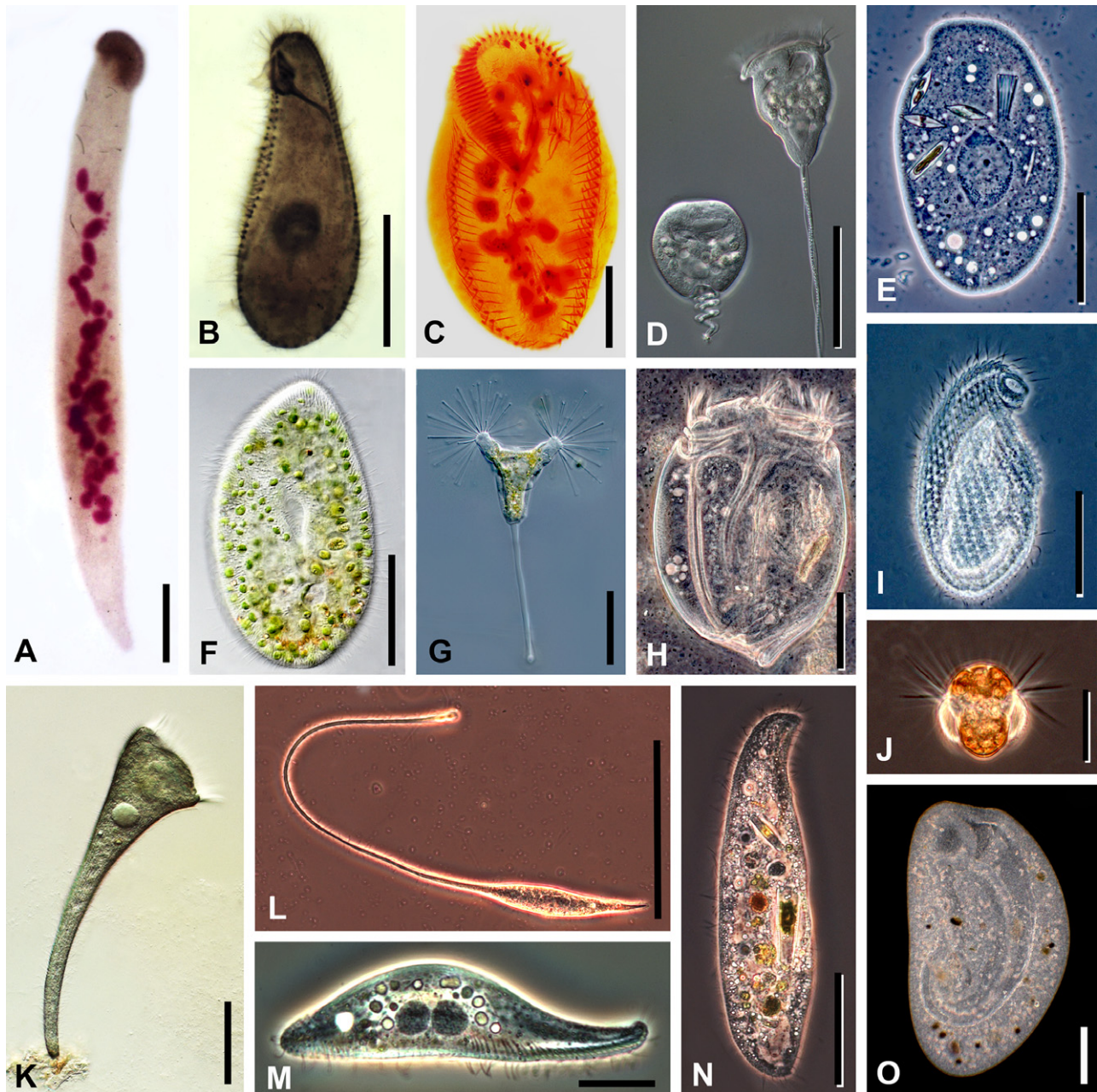
Figure 2 Photomicrographs of representative ciliate taxa (originals from D. J. Patterson). (A) Homalozoon vermiculare , a crawling, ribbon-shaped haptorian predator. The cell has been fixed and stained with Feulgen reagent. The anterior mouth, at the top of the image, is underlain with a dense band of extrusomes that are used to capture food. The structures stained pink are the irregular ribbon of macronuclear nodules, the micronuclei, and a few developing extrusomes. Scale bar = 50 \mu\text{m} . (B) Tetrahymena pyriformis , a hymenostome ciliate. The cell has been fixed and stained with protargol that impregnates the bases of the cilia (basal bodies) and the nucleus. The somatic cilia are arranged in longitudinal rows; the oral cilia are densely packed and appear as short bands. A system of microtubules that forms the cytopharynx extends from the mouth into the cell. The macronucleus is the globular structure near the center of the cell. Scale bar = 20 \mu\text{m} . (C) Pattersoniella vitiphila , a hypotrich ciliate. Fixed cell stained with protargol. The C-shaped collar around the front (top) of the cell is the adoral zone of membranelles (ciliary fans). The spots near the front of the cell, forming marginal bands and a curving row in the center of the cell, are cirri (ciliary bristles). The macronuclear nodules are the globular inclusions within the cell. Scale bar = 50 \mu\text{m} . (D) Vorticella convallaria , a peritrich ciliate. Two living cells under Nomarski differential interference contrast optics, the one to the right is extended and feeding, the one to the left is contracted. The feeding cilia (haplokinety and polykineties) extend around the edge of the anterior of the cell and curve into the mouth. The cells contain many food vacuoles. The stalk contains a spasmoneme that causes it to contract in a spiral fashion, while an elastic envelope acts as antagonist. Scale bar = 50 \mu\text{m} . (E) Trithigmastoma sp., a cyrtophorid ciliate. Living cell under phase-contrast optics. The cell eats small algae, using the basket-shaped mouth (upper right). Several ingested diatoms can be seen inside the cell.