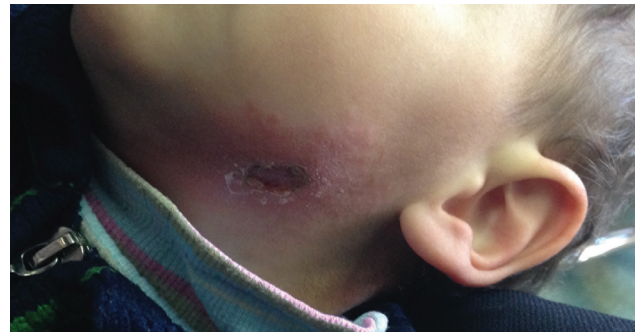
Figure 1 - Patient from Syria with cutaneous leishmaniasis.

Nucleotide sequences obtained in this study were aligned using ClustalW and the alignment was submitted to the GenBank. Basic Local Alignment Search Tool (BLAST®), used for search for similarities between the sequences, was applied to identify Leishmania species. Sixteen L. tropica sequences previously submitted to the GenBank from different countries were used to generate neighbor-joining (NJ) tree. Leishmania siamensis was used as an out-group in the NJ tree. Maximum parsimony (MP) and bootstrapping method was conducted with 1000 replicates using Geneious R. 8