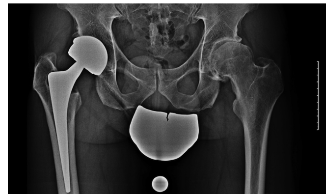
Figure 1. Plain anteroposterior radiograph 6 years after surgery shows well-fixed components.

After speaking with the patient, we decided to perform total hip replacement for severe end-stage osteoarthritis using MoM total hip implantation (Durom Metasul® Acetabular Component 52, cementless stem CLS 9/135° and head 48) using a posterolateral approach. The postoperative clinical course was good with normal range of movement and no major or minor complications. After 6 years without clinical symptoms, the patient returned to our attention to perform contralateral hip replacement surgery (Fig. 1). During the preoperative routine examinations, in consideration of the previous metal-on-metal implant on the right hip, blood examinations were performed, highlighting an increase in chromium and cobalt ions (Cr 1.6 mcg/L, Co 3.5 UG/L). The values of the 2 ions have increased constantly and magnetic resonance imaging was also performed showing fluid collection near the iliopsoas muscle (Fig. 2). Owing to the persistently elevated Co/Cr blood levels, following the previously mentioned guidelines [7], the patient was suggested to undergo revision surgery. The patient rejected this option, as it is completely asymptomatic (Harris Hip score 92), and for this reason, we opted for chelation therapy with oral high-dose NAC (1200 mg/die) starting in March 2017. The dosage involves taking 2 tablets a day (600 mg per tablet) every 12 hours. We