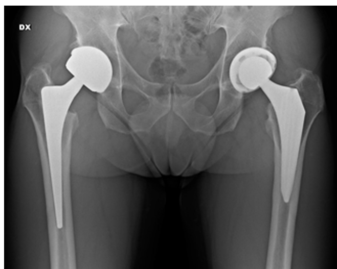
Figure 3. Plain anteroposterior radiograph at the last follow-up showing no worsening of the right hip.

Only 1 other case report describes the use of NAC in 2 patients, reporting that in the first case, Co/Cr blood concentrations were reduced by 86% and 87% of the prechelation levels, whereas in the other one, a decrease of 45% and 24% of the prechelation levels was reported [27]. The rational use of NAC involves thiol groups to chelate sites for metals [27]. Promising results have already been described in animal studies supported also by in vitro studies [28]. NAC has been reported not only as an effective and safe Co-chelating agent in some animal models but also as a potential Co chelator in humans in case of severe arthroprosthetic cobaltism [27–29]. In 1 animal study, NAC showed an increase in urinary chromium clearance. Of note, this was not due to any increase in concentration in the urine, but rather due to maintenance of the critical factors of adequate urine volume and output. In the study, Cr was taken in the form of potassium dichromate and animals treated with NAC reported a dramatic increase in Cr in the urine on the first day of therapy but on all days, the increase was statistically significant [30]. NAC is also able to reduce chromium