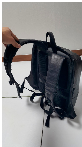
Figure 2. Backpack designed to reduce the moment arm.