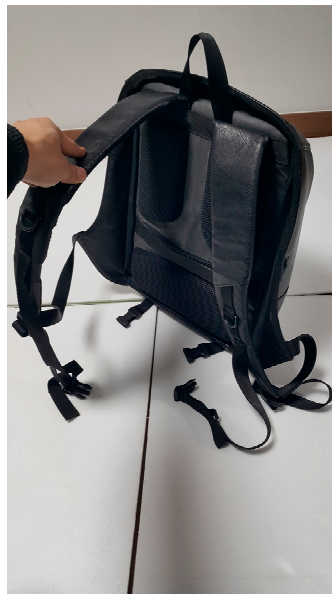
Figure 1. Backpack of typical design.

The subjects participated in the experiment without carrying the backpack, wearing the normal backpack, and wearing a backpack designed to reduce the load moment arm by placing the center of gravity close to the body. Typical backpacks are 30 cm width, 15 cm depth, and 45 cm height, with the design having a strap starting from the top of the backpack connecting to the lower part on the side (Figure 1). The backpack in the study was designed to reduce the moment arm by placing the center of gravity close to the body, having the same specification as a typical backpack. The strap starting at the top of the backpack is split into two straps in the middle, with one strap attached to the bottom of the side and the other strap to the side of the bottom (Figure 2). It was designed to reduce the load on the vertebral joint and reduce the load moment arm by minimizing the separation between the backpack and the torso.