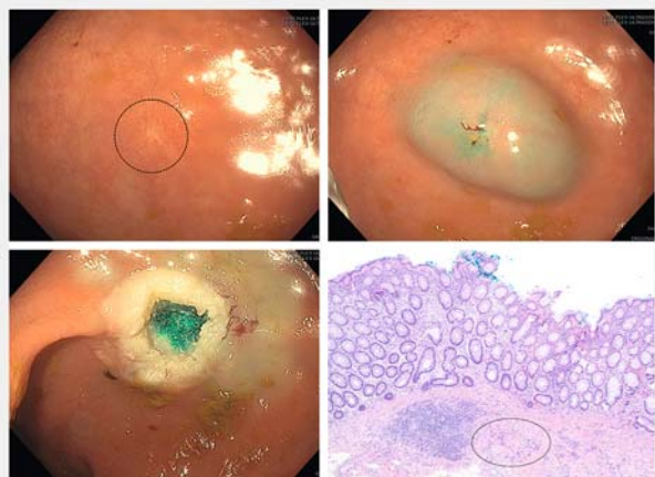
► Fig. 2 Top left: Healthy-appearing scar after initial resection. Top right: Saline lift for EMR of the scar. Bottom left: EMR resection site. Bottom right: Histopathology showing residual carcinoid tissue.

EUS, endoscopic ultrasound; EMR, endoscopic mucosal resection; ESD, endoscopic submucosal dissection; APC, argon plasma coagulation.