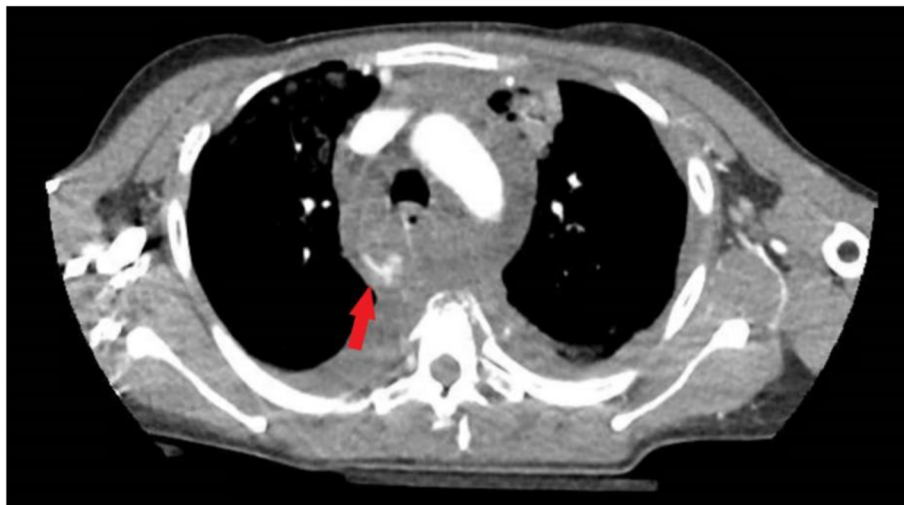
Fig. 1 Axial CT slice through the azygous venous arch showing active extravasation of contrast (arrow) from the inferior aspect of the arch

Based on these injuries, the decision to place a stent-graft across this azygous arch segment was made. The Cobra catheter was advanced back into the azygous vein and the V18 microwire was removed for an exchange length 0.035" Rosen wire. The Cobra catheter and 5Fr sheath were then removed and an 8Fr × 45 cm Pinnacle Destination sheath was advanced over the Rosen wire