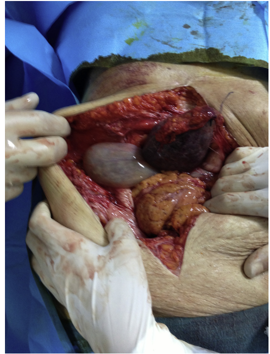
Fig. 3. Intraoperative view.

skin was thinner and there was sensitivity in this region (Fig. 1). There was no rebound pain or guarding. Bowel sounds were normoactive. The patient was lethargic and had a decreased response to stimuli. The neurological examination revealed a flapping tremor and stage 2 encephalopathy. Laboratory test results were as follows: hemoglobin (Hb): 13.8 g/dl, hematocrit (htc): 40, leukocytes: 17000/mm 3 , glucose: 120 mg/dl, blood urea nitrogen (BUN): 20 mg dl, creatinine: 0.9 mg/dl, aspartate aminotransferase (AST): 225 U/ml, alanine aminotransferase (ALT): 288/ml, amylase: 77 U/ml, Alkaline phosphatase: 75 IU/l, international normalized ratio (INR): 1.6, and total bilirubin: 3 mg/dl.