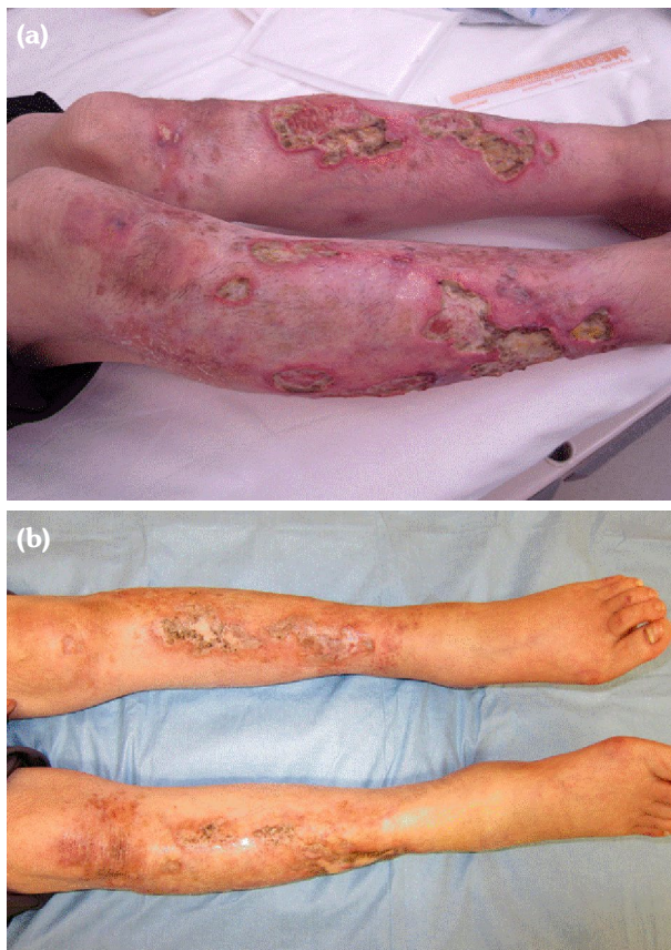
Figure 1. (a) Deep ulcerations dominated on lower leg. (b) An atrophic scar after therapy with etanercept.

patients with LEP. 1,2 Recently, reports have shown that LEP-related ulcerations can be controlled with cyclosporine or tacrolimus. 3 However, this patient did not respond to tacrolimus. Regarding tumor necrosis factor-alpha (TNF- \alpha ) blockade, a report showed that LEP could be controlled with infliximab 4 and that TNF- \alpha -blocking therapy was potentially useful in SLE treatment. 5 In SLE, keratinocytes are regarded as a major source of TNF- \alpha . 6 High levels of TNF- \alpha lead to the activation of B, T, and dendritic cells, promoting inflammation. Moreover, excessive TNF- \alpha expression delays wound healing due to \alpha -smooth muscle actin expression suppression. 7