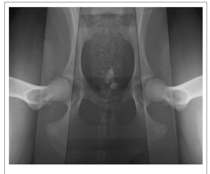
FIGURE 2 | Hip distraction view using the Dis-UTAD distractor. The pelvis and the distractor are centered and symmetrical, and the more pronounced lateral band opacity of the distractor overlaps the femoral heads.

TABLE 1 | Paired variable differences between CertD and Dis-UTAD.