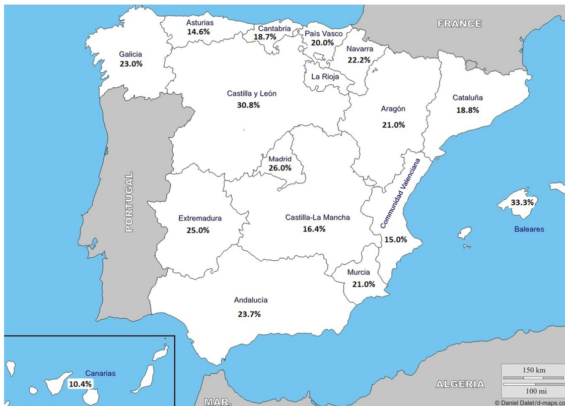
Figure 5 Geographic distribution of the prevalence of the exacerbator phenotype with chronic bronchitis showing the highest prevalence rate in Castilla-León, Balearic Islands, and Madrid.

Note: Courtesy of http://d-maps.com/carte.php?num_car=2210&lang=es .