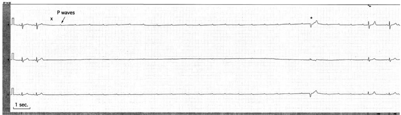
Fig. (2). Original ECG Holter monitoring tracing showing the longest pause lasting 15,9 sec, caused by a total AV block during day time. Concurrently with these pauses, a note in the daily diary reported by the nurse describes a short-lasting “period of falling asleep”, while the patient was in the sitting position. Unconducted P waves are clearly evident at frequency of 75 bpm. Before the end of the pause, a ventricular escape beat is evident.

In our case, the syncope duration were borderline (about 15 sec), very frequent, often subsequent and the sitting position on a wheelchair prevented the patient from falling down. Furthermore, the coexistence of an AdD, often associated with fall asleep, masked the association with the conduction disturbance. Therefore, the EHM was requested for the bradycardia in pre-existing AV block type I, in order to screen for possible AV blocks that are very common in elderlies.