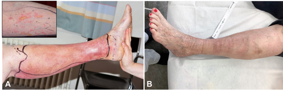
Fig 3. A , Painful swelling and redness in the left leg, warm and tender to touch, mimicking an erysipelas or a cellulitis associated with systemic symptoms and fever (temperature up to 40 °C). Erythematous papules and plaques with pseudobullous appearance on the left forearm (Inset). B , Complete regression of the clinical signs and the inflammatory syndrome after treatment with oral prednisolone. Signs of chronic venous stasis with varicose veins and pigmentation can be recognized.