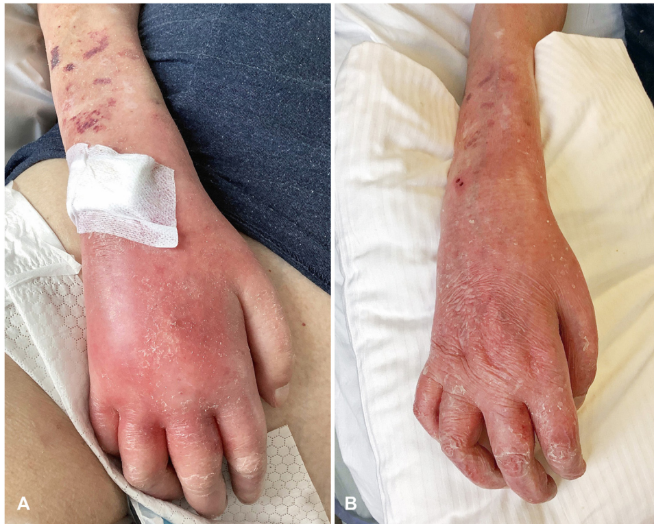
Fig 1. A, Symmetric acral involvement with an acute painful erythematous swelling of the dorsal surface of hands and fingers. B, Quick regression of the inflammatory syndrome and peripheral edema 5 days after treatment with topical clobetasol propionate cream, empirical intravenous antibiotics, and protein-rich nutrition.