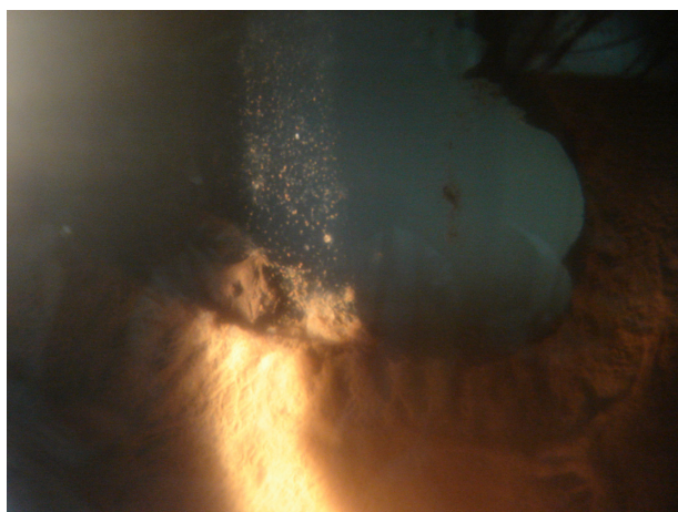
Figure 1 Details of anterior uveitis in our patient.

Vogt–Koyanagi–Harada (VKH) syndrome was suspected, so corticosteroid treatment was initiated. Ten days later, the patient had not improved. Ocular and neurological manifestations were the same as at initial presentation. The situation worsened when the patient presented in acute renal failure with high creatinine and urea, and proteinuria and hematuria. All results were negative except for unexpected positive IgM (1/64) and IgG (1/264) titers for C. burnetii (phase II antigen), leukocytosis ( 17.3 \times 10^9/L ), and deranged liver enzymes. Indirect immunofluorescent antibody tests were repeated and confirmed the diagnosis (IgG reached titers of 1/1024).