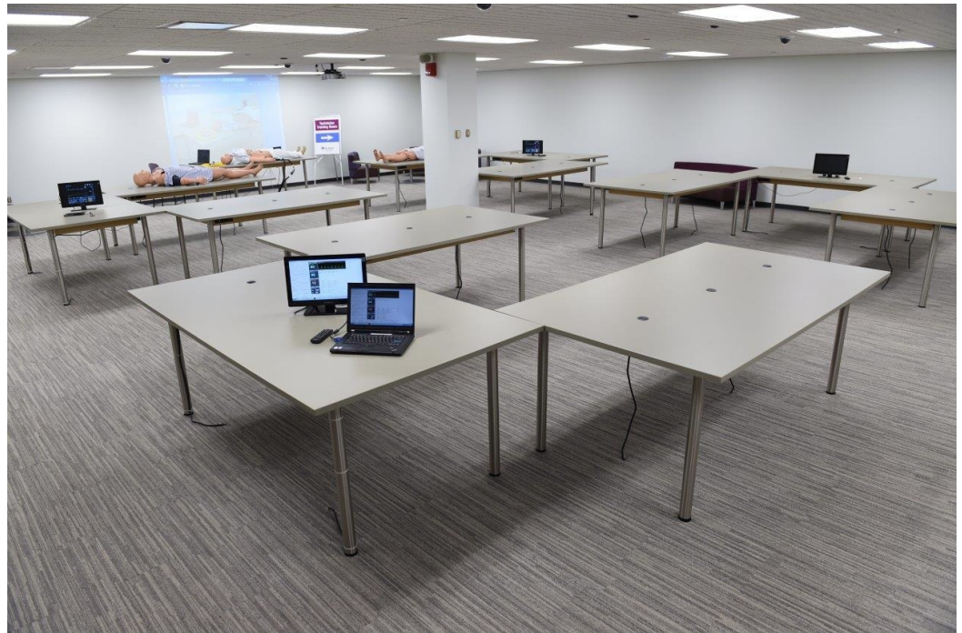
FIGURE 2: Technician classroom

The addition of an online audio/visual learning management system (LMS) permits the Master Instructor to see the students' progress through a monitor located at the Master Instructor worktable. The monitor allows the Master Instructor to visualize all 24 potential students at once with the option to focus in on a single student with a mouse click. Additionally, the audio/visual LMS also allows each student to get a close-up view of the Master Instructor's worktable, which provides detailed technical instruction and the ability to see the Master Instructor's hands as he/she demonstrates the steps of a technical skill. This can be visualized through individual monitors placed at each student's workstation. This configuration conveniently allows all students to follow along during class without needing to walk to each work table within the instructional facility or to be crowded around the Master Instructor's worktable. The facility also has a large liquid crystal display (LCD) 10 x12 foot screen located in the front and sides of the room. This screen offers a large audio/visual image for anyone not viewing their individual monitors.