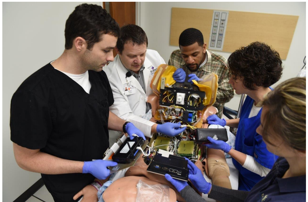
FIGURE 4: Technical repair training for simulation technician students