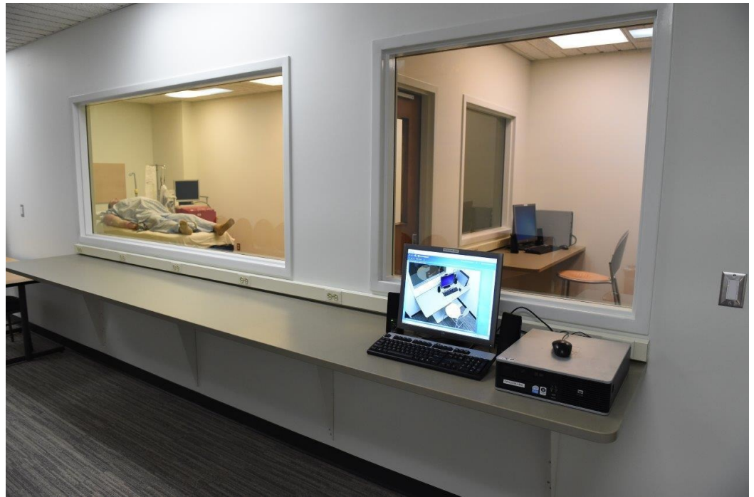
FIGURE 3: Technician control room training area ("Control room looking into a control room")

standardized confederate actors portraying the role of learners, to create situations that the technician-in-training may not anticipate and will need to troubleshoot (Figure 4).