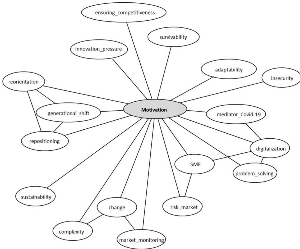
Fig.1 Motivations for business transformation (own elaboration)

thereby considered useful for the transformation of internal processes and structures.