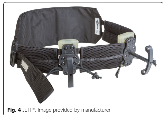
Fig. 4 JETT™.

flow to the lower extremities and to the pelvic region is blocked. Successful usage of junctional as well as truncal application has been reported in the military setting [49, 50]. Truncal application in animals was found to have minimal side effects when used for 30 min. Pregnancy, abdominal aneurysm and penetrating abdominal trauma are considered to be contraindications for truncal use of the AAJT™ [44].