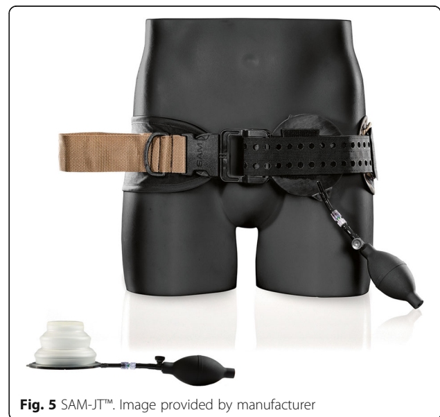
Fig. 5 SAM-JT™. Image provided by manufacturer

Kragh et al. compared the four junctional tourniquets in a simulated out-of-hospital situation by army medics. Unfortunately, at the time of the study, the AAJT™ was only FDA-cleared for truncal application. U.S. armed forces medics preferred the CRoC™ and SAM-JT™ over the JETT™ and (truncal) AAJT™ if they could bring one device on a mission, after testing the various designs at each other [43]. Kotwal et al. reported feedback from battlefield use. The AAJT™ was reported “to be easily broken” and the CRoC™ as “bulky, heavy and takes too