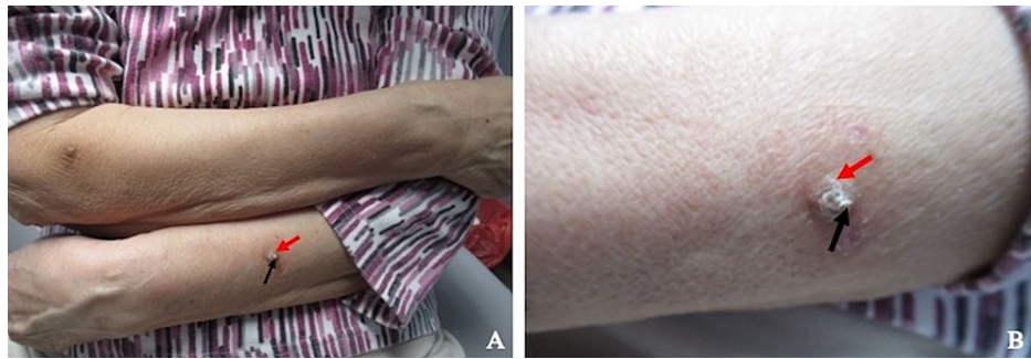
FIGURE 1: Clinical presentation of verruca vulgaris-associated cutaneous horn

Distant (A) and closer (B) views of a verruca vulgaris (red arrow) associated with overlying cutaneous horn (black arrow) on the left forearm of an 81-year-old woman.