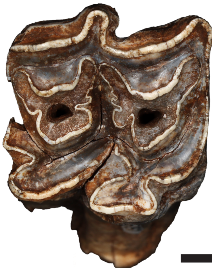
Figure 2 Example of teeth assigned to Equus capensis (Specimen CD 5881, Upper M1). Note that the protocone is not isolated as is the case in hipparions.