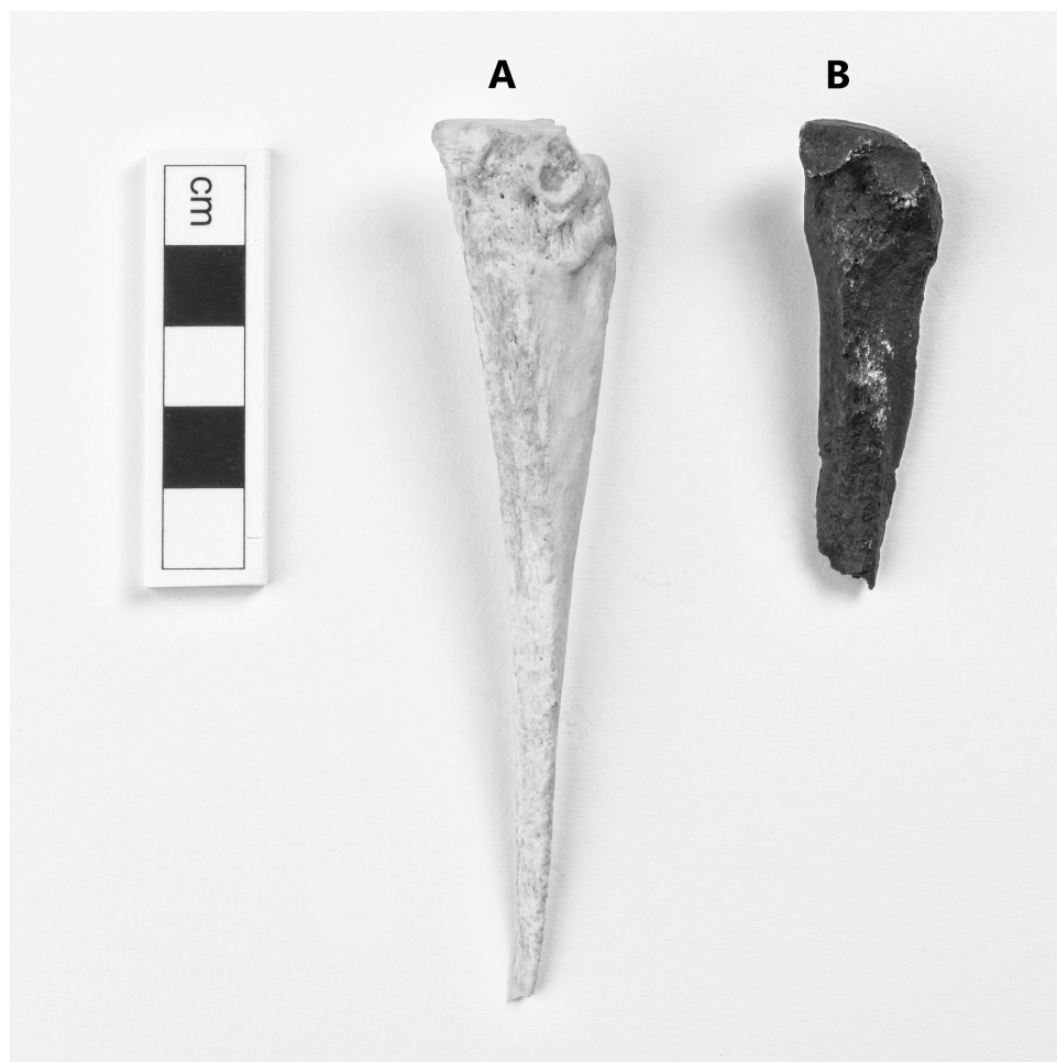
Figure 3 (A) a right metacarpal IV of Equus quagga (AZ 1131). B: CD 24345, a right metacarpal IV, which is likely from Eurygnathohippus cornelianus (see Table 2).