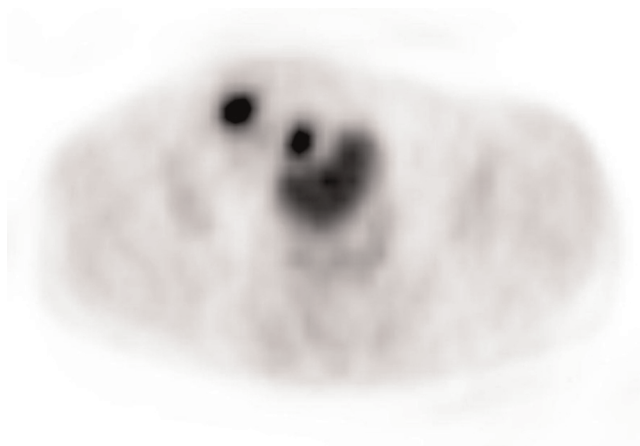
Figure 3. Right lower quadrant mass in axial PET scan.