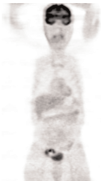
Figure 1. Right lower quadrant mass and urinary bladder activity in coronal section.

Combined PET/CT imaging is a non-invasive nuclear medicine procedure that is gaining increasing application in oncology as a standard modality in the diagnosis of occult cancers, restaging and monitoring of therapeutic efficacy. Metabolic abnormalities detected on PET images can be precisely localized anatomically by hardware fusion with the CT images obtained in the same sitting. Tissues with increased glucose metabolism, such as malignant lesions, appear as areas of increased activity on PET scans due to the trapped FDG within the cells. We observed a