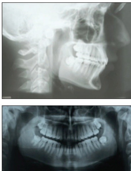
FIGURE 5: Posttreatment lateral and panoramic radiographs.