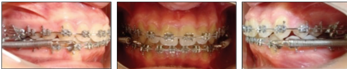
FIGURE 3: Progress intraoral photographs after application of the Forsus FRD.

were obtained and overjet was eliminated. Active FRD application took 4 months. Total active orthodontic treatment period was 16 months. After obtaining ideal overjet, overbite and a functional interdigitation, brackets were removed and the retention period began (Figure 4). Increase in the mentolabial angle was significant in posttreatment facial photograph (Figure 4).