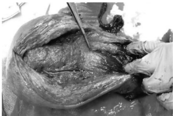
Figure 2 Uterus after hysterectomy with the cervical laceration ending at the tip of the surgical forceps.

Postoperative examination of the uterus demonstrated a low uterine segment laceration, which was confirmed histopathologically (Fig. 2). Postpartum hypopituitarism (Sheehan syndrome), a rare complication of massive PPH, was ruled out by testing the pituitary