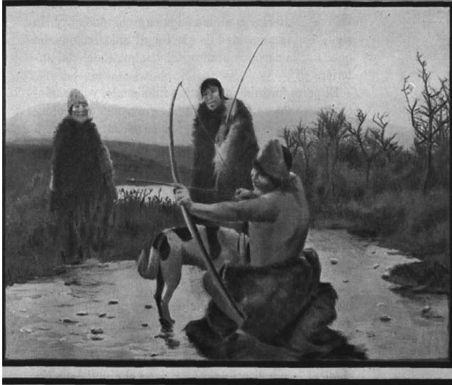
FIGURE 1 Reproduction of a drawing found in “The Onas” by Carlos Gallardo (1910) titled “Educating the dog” ( Educando al perro ). Some characteristics mentioned in the text can be seen in the drawing of this Fuegian dog. The image is free of copyright ( http://www.memoriachilena.gob.cl/602/w3-article-8403.html )