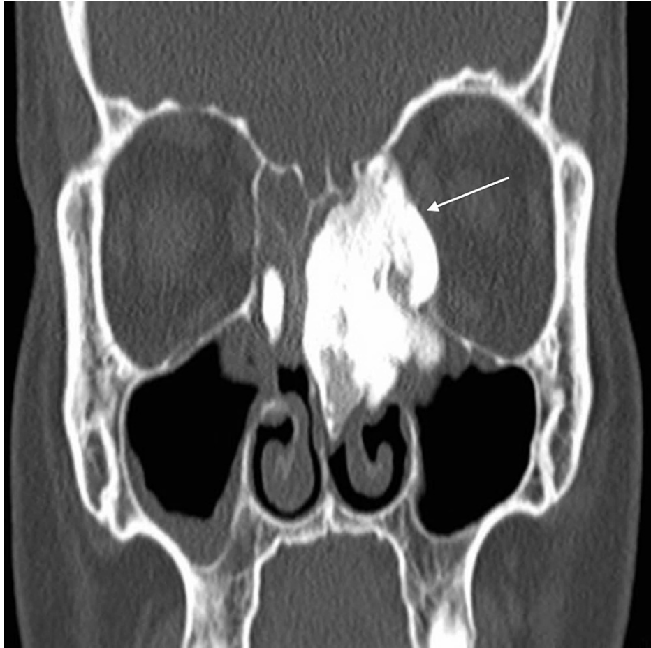
FIGURE 3: Preoperative CT scan: coronal view shows lesion extension from left ethmoid sinus into left orbital cavity.