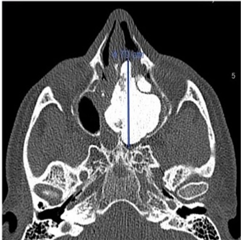
FIGURE 2: Preoperative CT scan: axial view shows 4.7 x 3.5 cm left ethmoid lobulated hyperdense lesion.