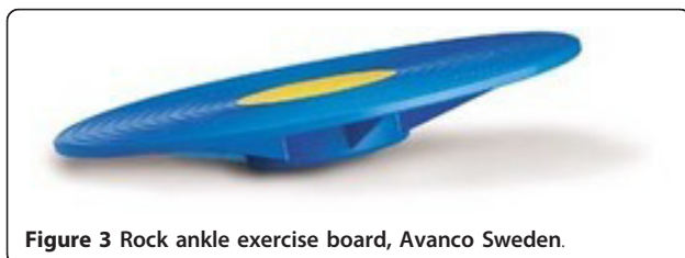
Figure 3 Rock ankle exercise board, Avanco Sweden.

All participants of the neuromuscular training group received the same balance board (Figure 3) for free. Furthermore general written and visual information on the duration and intensity of the program were provided. In addition, a website was created including basic information on the project and a section only accessible for each group's subjects. The exercise frequency was,