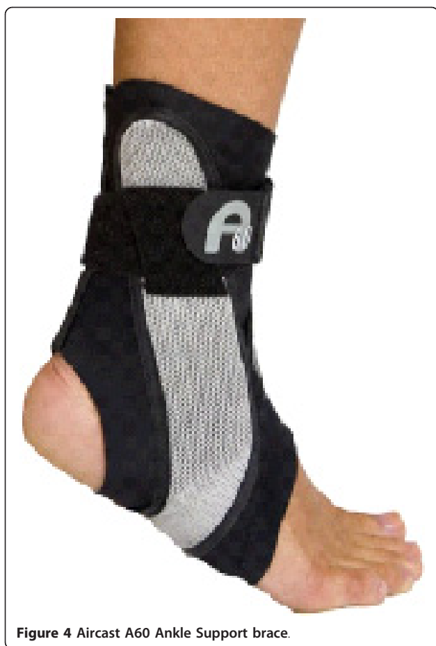
Figure 4 Aircast A60 Ankle Support brace.