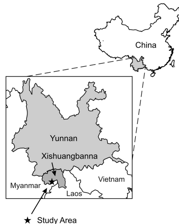
Figure 1. Location of the study area in Xishuangbanna prefecture, Yunnan province, China. doi:10.1371/journal.pone.0069357.g001

The major land-use types in Menglong township include rubber plantations, secondary forests, and farmland. According to local plantation owners the dominant land-use change trajectories in Menglong township were: (i) Primary forest–swidden agriculture–secondary forest–rubber plantation, and (ii) primary forest–swidden agriculture–rubber plantation. Swidden agriculture was the dominant land-use type in the region for centuries [19]; this involved cutting and burning of vegetation patches in the forest, thereby creating fields for use as rotation of cropping phases (1–3 years) and fallow periods (5–20 years) during which secondary vegetation regrows [11,20]. The widespread practice of swidden cultivation in the past resulted in loss and degradation of primary forests [21]. Nowadays, almost all swidden fields have been replaced by monoculture rubber plantations. Since primary forest and swidden agriculture are not present anymore, we focused on the more recent land-use change from secondary forest towards rubber plantations. Based on information from local plantation owners, we selected rubber plantations that all went through this land-use change trajectory. Forest clearing was done by hand and no heavy machinery was used. After forest clearing, the sites were