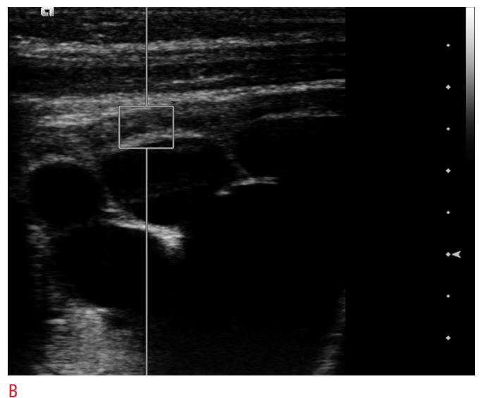
Fig. 1. Shear wave velocity measurements in a two-month-old girl with hydronephrosis.

Figures show acoustic radiation force impulse measurements with a 4–9-MHz linear transducer using a 5 mm \times 6 mm region of interest including both the renal cortex and the medulla with a normal right kidney in the axial view (A) and a hydronephrotic left kidney in the axial view (B). Note that the region of interest includes a calyx in the hydronephrotic kidney, which can cause a partial volume effect.