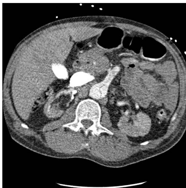
Fig. 3. Preoperative contrast CT-scan highlighting involvement of the superior mesenteric artery.