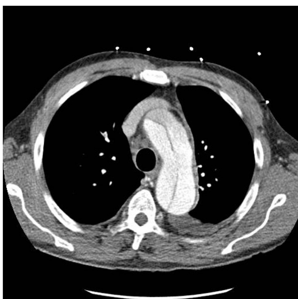
Fig. 1. Preoperative contrast CT-scan highlighting arch involvement.

myocardial protection. Body temperature at 24 °C was considered as a compromise in view of the sickle cell anaemia. Antegrade cerebral perfusion was achieved with cannulation of each epi-aortic vessel following longitudinal incision of the ascending aorta and arch. Continuous, non invasive monitoring of cerebral oxygen saturation was maintained with near infrared spectroscopy (NIRS)