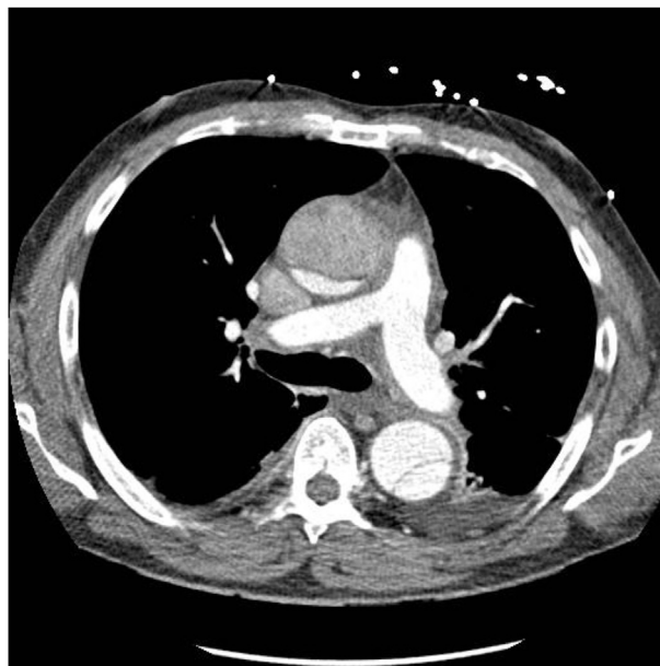
Fig. 2. Preoperative contrast CT-scan showing false and true lumen relationship in ascending and descending thoracic aorta.

The patient was transferred once again to our hybrid theatre and prepped in the supine position. Invasive arterial and venous monitoring was obtained through the left and right radial artery, left femoral artery and right internal jugular vein. Cardiopulmonary bypass was established through right femoral and right atrial cannulation. Antegrade and retrograde cold blood cardioplegia was delivered for