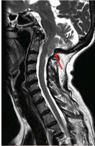
Fig. 3: Sagittal magnetic resonance reconstructions of an ACM-I female patient demonstrating the cerebellum herniation into the vertebral canal (red arrow).

related to the TMJ and associated structures are needed, since disorders of the joints may coexist, possibly being amplified in these patients.