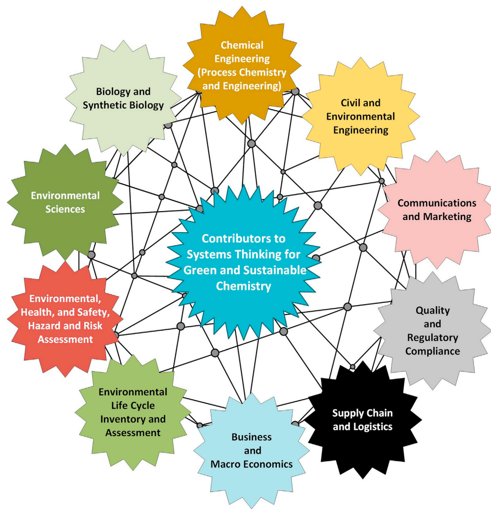
Figure 2. Contributors to systems thinking for green and sustainable chemistry

help the chemist understand environmental and human health hazards and risks. Interestingly, the greenness of the organometallic catalyst synthesis itself, where large or complex ligands are made using hazardous reagents, and difficult, inefficient, multi-step syntheses are common, is not featured in most catalysis discussions. Or, the catalytic reaction requires the use of reagents like triphenylphosphine, organoboranes, or similarly activating reagents that are not only mass inefficient, but hazardous. Moreover, many of these catalysts are only active as homogeneous catalysts; their binding to an inert substrate renders them less active or inactive. And while some in academic research think about catalyst recovery, homogeneous catalyst recovery and reuse remains technically difficult and largely an afterthought.