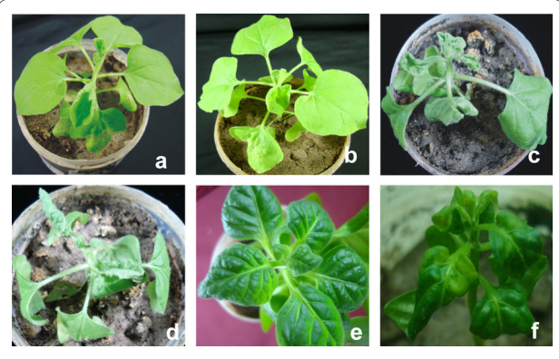
Figure 4 Symptoms induced by PepLCLV clone PGL1 in N. benthamiana, N. tabacum and C. annum. a) An N. benthamiana plant infected with PepLCLV at 20 days post-inoculation (dpi) b) An N. benthamiana plant infected with PepLCLV and ChLCB at 20 dpi. c) A N. benthamiana plant infected with PepLCLV and ToLCNDV DNA B at 14 dpi. d) A N. benthamiana plant infected with PepLCLV, ChLCB and ToLCNDV DNA B at 14 dpi. e) A N. tabacum plant infected with PepLCLV and ToLCNDV DNA B at 30 dpi. f) A C. annum plant infected with PepLCLV and ToLCNDV DNA B at 40 dpi.

specific DNA binding protein which recognises and binds to repeated sequences, known as iterons, in the intergenic region immediately upstream of a hairpin structure that contains the ubiquitous (for geminiviruses) nonanucleotide sequence (TAATATTAC). Rep then initiates replication by nicking in the nonanucleotide sequence. The DNA A and DNA B components of bipartite begomoviruses have the same iteron sequences, thereby ensuring that the DNA A-encoded Rep may initiate replication of both components; maintaining the integrity of the split genome. However, mutational analyses and sequencing of field isolates suggests that begomoviruses may tolerate some sequence