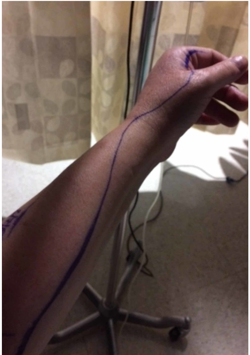
FIGURE 2: Edema and erythema extending to the forearm while the patient was admitted in the hospital

The patient followed up a month later. Her nodules on the left index finger continued to persist. She also informed that her yearly QuantiFERON-TB gold test performed with the rheumatologist had seroconverted to positive. QuantiFERON-TB gold plus results showed a TB1-NIL value of 3.96 IU/mL and a TB2-NIL value of 4.16 IU/mL. The patient always had negative QuantiFERON-TB gold in the past and had no risk factors for tuberculosis. Her chest