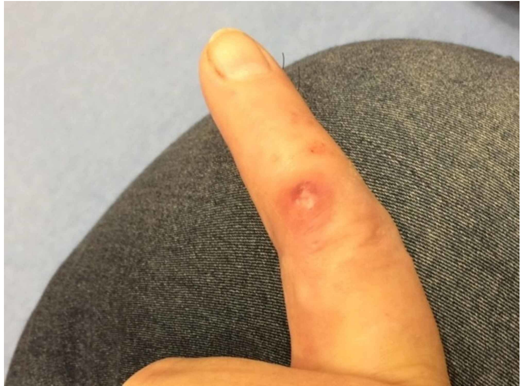
FIGURE 1: Nodule on the index finger

referred to the orthopedics department where an ultrasound was performed, which did not reveal any abscess; therefore, she was sent to the Infectious Disease Clinic for further management. Due to failure to respond to oral antibiotics, she was admitted to the hospital (Figure 2), where she was started on vancomycin, ceftriaxone, and clindamycin. The redness and streaking appeared to have improved with antibiotic therapy, and she was discharged on clindamycin and cefdinir for 10 days.