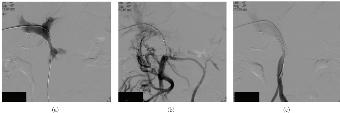
FIGURE 2: (a) Percutaneous portography. A segmental stenosis is noted cranial to the portal vein—splenic vein junction. (b) Percutaneous portography. As a consequence of the portal vein stenosis, extensive collateralisation takes place. (c) Percutaneous portography. After balloon dilation, a stent is inserted. Angiographic control confirms the improved lumen diameter and immediate loss of compensatory collateral flow.

consecutive CT scan. Nevertheless, during chemotherapy, the portal vein became progressively stenotic over a short segment with subsequent venous collateralization (Figures 1(a) and 1(b)). Arterial collateralisation secondary to the encasement was not present. Also, CA19.9 decreased to normal range during chemotherapy.