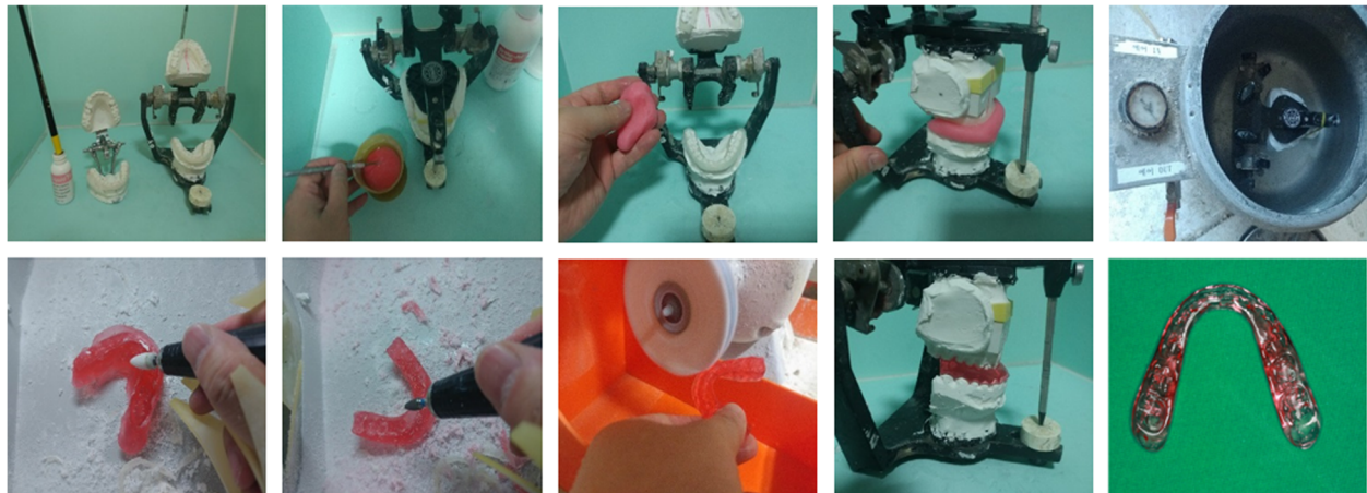
Fig. 1 Stent fabrication progress in conventional surgical planning

group II patients (BSSO regardless of genioplasty). Two different dental hygienists, four technicians (2 radiographers, 2 dental technicians), six 2-year residents (R2), and eight interns were involved in the cases. The average times of all the steps in the workflow of CSP and VSP for groups I and II are shown in Table 2. Overall, VSP takes less time than CSP. The average time of CSP in group I was 385 \pm 7.8 min and that in group II was 195 \pm 8.33 min. The average time of VSP in group I was 143.2 \pm 7.6 min and that in group II was 114.1 \pm 7.12 min [Table 2]. When the time reduction rates were compared by category, it was found to be highest in the laboratory process. In group I, the time reduction rate was negative at the office workup step, and VSP seems to have taken longer, but the difference was not statistically significant (Table 3). The average cost of CSP in group I was 805,015 KRW and that in group II was 508,061 KRW. As for VSP, its average cost in group I was 885,905 KRW, and that in group II was 624,267 KRW (Table 4). The overall cost reduction rate was -9.1\% in group 1 and -18.6\% in group 2, and the cost reduction rates by category are shown in Table 5.