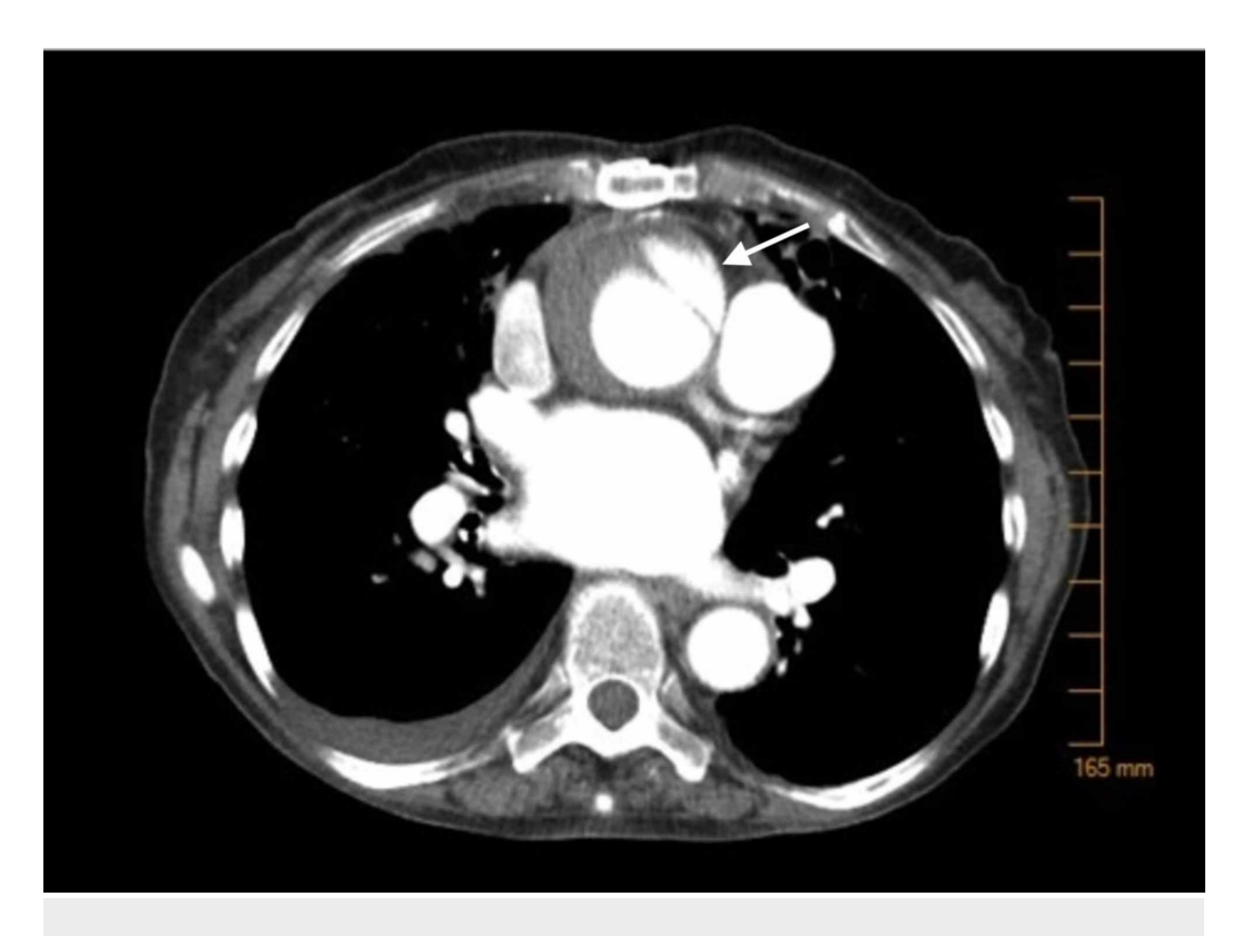
FIGURE 1: Arrow showing ascending aortic pseudoaneursym.

Upon receiving CT results, the patient was admitted; she continued to endorse generalized fatigue, weakness, and shortness of breath. The patient was afebrile and denied any chest, back, or abdominal pain, nausea, vomiting, diarrhea, wheezing, or coughing. Vital signs were as follows: Temp. 98.1°F, heart rate (HR) 71, blood pressure (BP) 141/64, respiration rate (RR) 22, SpO2 94% on ambient air. On evaluation, the patient was deemed a poor candidate for surgical repair and replacement of the ascending aorta due to her advanced age, multiple comorbidities, and high likelihood of requiring a repeat procedure thus, the family and care team elected for medical management.