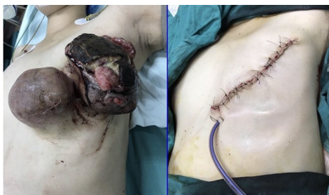
Fig. 1. The patient presented with two large, ulcerative and bleeding breast masses. The tumors were then completely removed.

to a healthy girl after two months. After two years of follow-up, there have been no signs and symptoms of recurrence or metastasis.