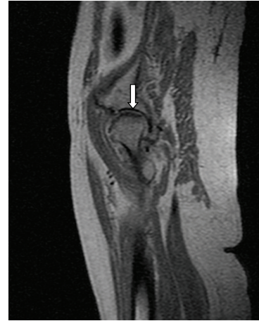
FIGURE 1: Aseptic necrosis (avascular) of the left femoral head with flattening of the subchondral bone (arrow).

The patient was taken to the operation room, where exploratory laparotomy detected an 80 cm-length necrosis of the terminal ileum and cecum. A 100 cm bowel resection was performed. Upon return to the ICU, the individual persisted with hemodynamic instability, despite administration of increasing doses of noradrenaline. Acute respiratory distress syndrome (ARDS) developed (Figure 3), with disseminated intravascular coagulation. The patient died on the 4th postoperative day. Macroscopic analysis of the surgical specimen showed an apparent vascular patency and the absence of thrombi or atheromatous plaques within the vascular trunks or arteries and veins of smaller caliber. Moreover, there were no stenosis areas in the arterial network around the infarcted area.