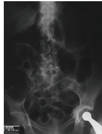
FIGURE 2: Abdomen radiograph showing the presence of high level of air fluid in the bowel loops.