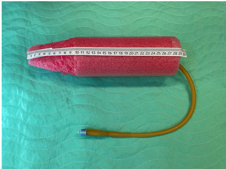
FIGURE 2: The rectal foreign body with associated Foley catheter and ruler for scale