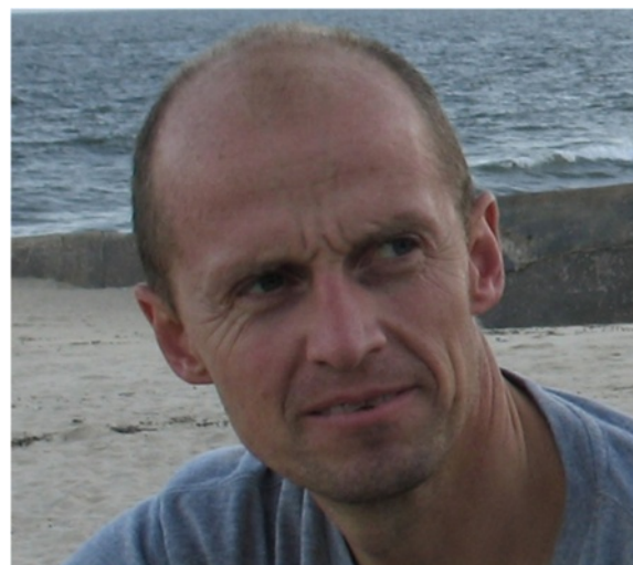
Fig. 8 Lorenz von Seidlein has worked for 20 years on malaria and other issues in global health. He worked in The Gambia on the first evaluations of ACTs in sub-Saharan Africa, and has managed several large vaccination projects. He is currently coordinating a major effort to eliminate malaria from areas with artemisinin resistance with the Mahidol Oxford Research unit in Bangkok, Thailand

The currently applied strategies towards malaria elimination mainly consist of vector control and case management. During the past century stringent implementation of these approaches has eliminated the disease in a number of countries ranging from Australia through the USA and reduced malaria to very low levels in many countries in Asia and Latin America [39]. As long as malaria therapy is efficacious and vector control measures work, continued and concerted efforts should slowly but steadily reduce further the burden of malaria. However, the current emergence of antimalarial and insecticidal resistance threatens to reverse these achievements in malaria control and increases the demand for interventions accelerating malaria elimination.