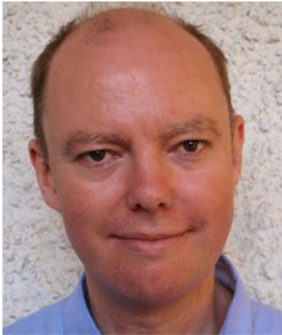
Fig. 3 Christopher JM Whitty is Professor of Public and International Health at the London School of Hygiene & Tropical Medicine (LSHTM), and Chief Scientific Advisor and Director of Research at the UK Department for International Development (DFID). He was previously director of the LSHTM Malaria Center and of the ACT Consortium

The debate around diagnosis for malaria elimination sometimes implies that the major issue is obtaining more sensitive diagnostic technology. Whilst improved