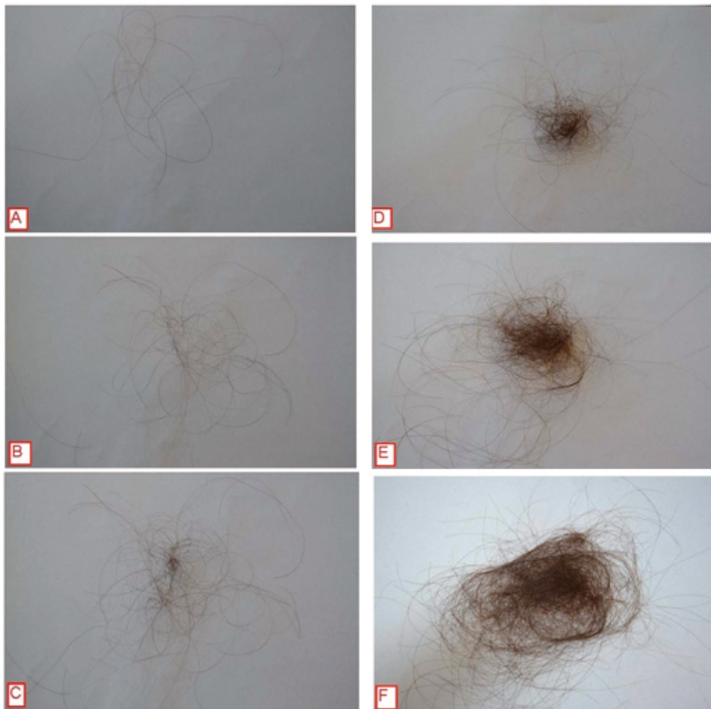
Figure 1. Hair shedding scale. Scores vary between 1 (minimal shedding) to 6 (copious hair shedding) 12 .

Primary CTE most commonly occurs suddenly in females between 30 and 50 years of age. Additional clinical features commonly seen in primary CTE include bi-temporal recession of