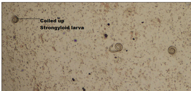
Figure 1: Coiled up strongyloides larvae

Antibiotics were added as per sensitivity reports. Ivermectin 12 mg once daily was added. A high ionotropic support was given to maintain mean arterial pressure of 65 mmHg.