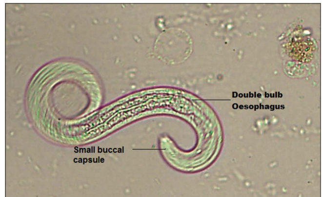
Figure 2: Double bulb esophagus