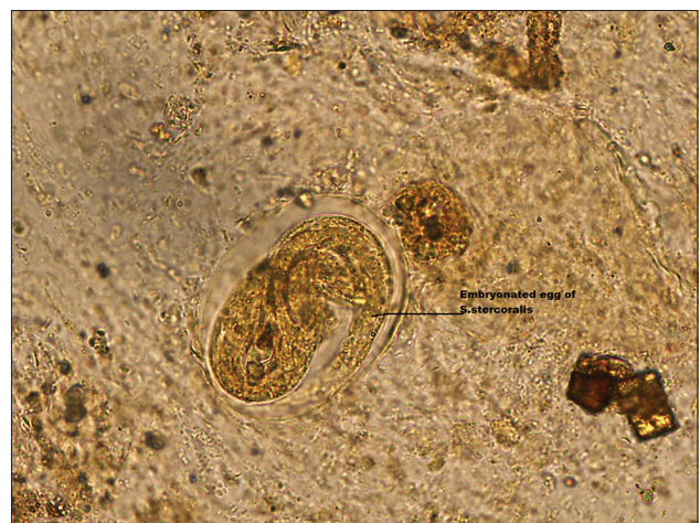
Figure 4: Embryonated egg