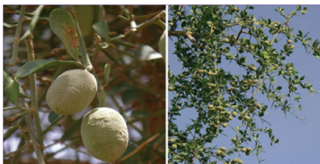
Figure 1: Balanites aegyptiaca Del