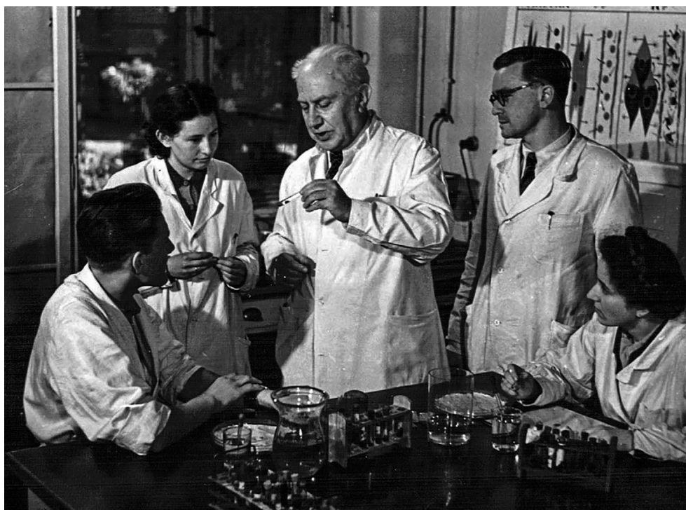
FIGURE 4 Ludwik Hirszfeld with students. Wrocław, around 1950 [69]

A large part of Ludwik Hirszfeld's interest in forensic medicine was paternity testing. Blood grouping has been used to that end since