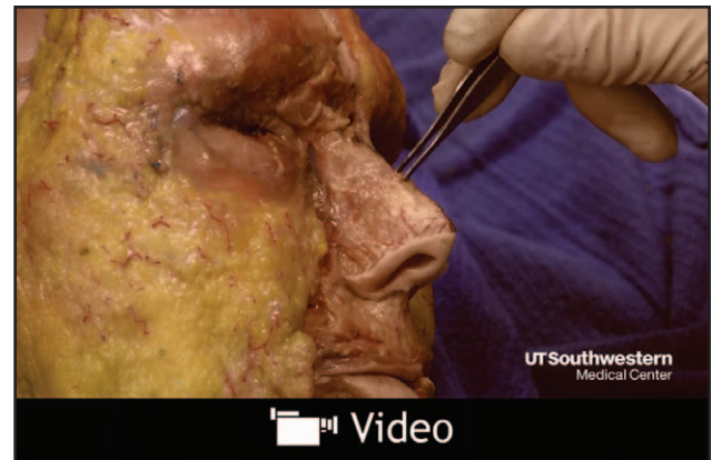
Video Graphic 3. Anatomical approach to injectables in the nose and lips teaches the proper techniques to safely administer injectables into the nose and perioral regions by demonstrating on a cadaver. This video is available in the “related videos” section of the full-text article on PRSGlobalOpen.com or available at http://links.lww.com/PRSGO/A312 .