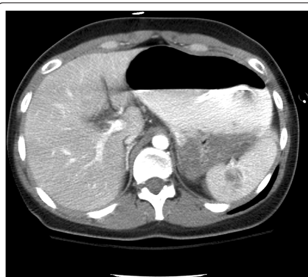
Figure 1 Abdominal CT scan of parenchymal splenic laceration without obvious vascular injury at 01:16 am.

Six patients had an active blush or suspected pseudoaneurysm on the initial CT scan upon which SNOM would presumably be based. Of the six patients for whom SNOM was attempted without addressing the blush or early pseudoaneurysm, one may have been related to an inadvertent delay to OM, with the remaining five cases occurring early in the series (four cases