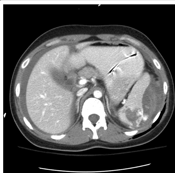
Figure 2 Abdominal CT scan of same patient revealing active contrast extravasation at 08:13 am.

from 2001 and one case from 2003). Five patients who failed SNOM also developed active extravasation present on follow-up CT scans which were done nine hours (Figures 1 and 2), two, seven, nine, and ten days after admission. Overall, 11 of 53 (21%) failures of SNOM revealed acute vascular extravasation. A more detailed comparison between those patients treated successfully compared with those who failed SNOM is also presented in Table 1.