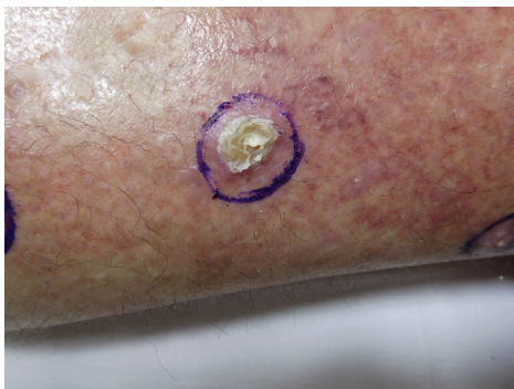
Fig 2. This 1.2- × 1.1- × 0.3-cm hyperkeratotic, irregular, tan-white to tan-yellow exophytic lesion was excised with clear margins. Pathology findings confirmed well-differentiated SCC.