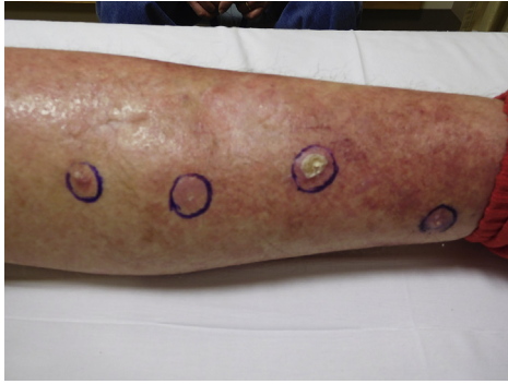
Fig 1. Four friable lesions arose synchronously on the burned area of the patient's left calf 7 weeks postburn. An additional pretibial lesion arose simultaneously, also in an area that had been burned (not pictured).