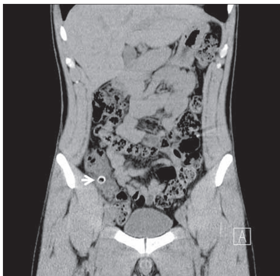
Figure 1. Computed tomography (CT), coronal section, shows a fatty oval lesion measuring 12 mm in diameter with a circumferential hyperdense ring in the right lower abdomen.

In the present case, CT images showed a fatty, ovoid, pericolonic mass with a circumferential hyperdense ring, surrounded by ill-defined fat stranding. The thin hyperdense rim is called the hyperattenuating ring sign, which represents the inflamed peritoneal covering of the epiploic appendages [1]. The typical findings were diagnostic of primary epiploic appendagitis [1,2], which is caused by epiploic appendage torsion or spontaneous thrombosis of the draining vein resulting in vascular occlusion and focal inflammation [1]. Epiploic appendages are small, multiple, fat-filled,