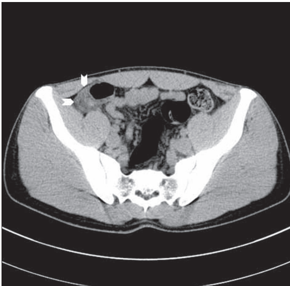
Figure 3. Thickening of the parietal peritoneum is seen.

diagnosis [1]. With increased awareness of this condition, however, evaluation by CT can provide an accurate diagnosis of epiploic appendagitis, distinguishing it from conditions with clinically overlapping manifestations such as diverticulitis, acute appendicitis, and acute cholecystitis [1,2]. Ultrasound coupled with awareness of this condition and/or performed by expertise can reveal epiploic appendagitis as an ovoid, non-compressible fatty mass with normal aspect of the adjacent colon which is adherent to the peritoneum during respiration [5]. However, in this case the expertise was not available and ultrasound was performed without awareness of epiploic appendagitis, thus ultrasound could not give the diagnosis in our patient.